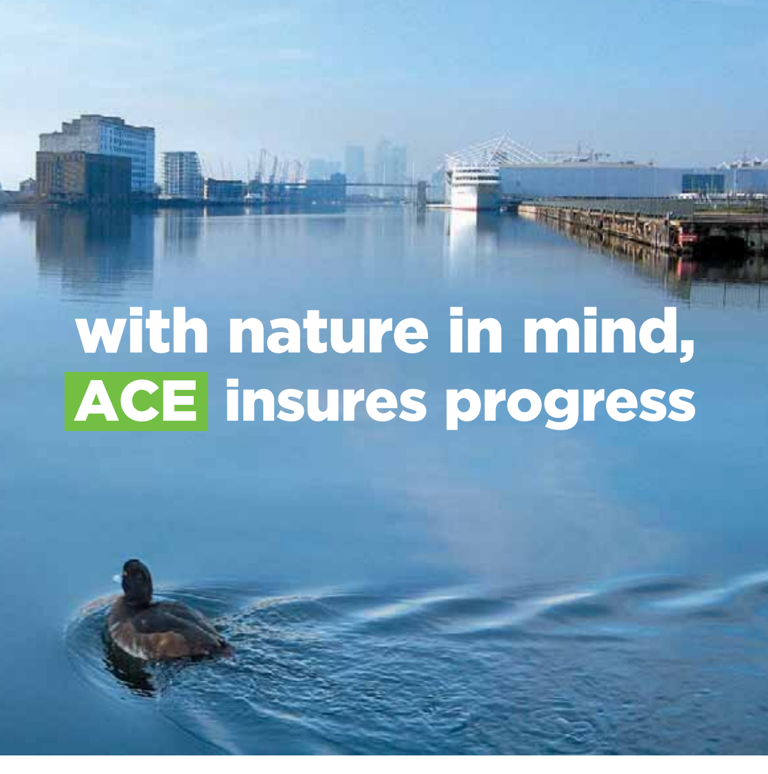
Property & Casualty | Accident & Health | Life

It takes the right people, a strong balance sheet, worldwide capabilities and a flexible approach to understand the delicate balance between industry and the environment. These are the strengths of ACE and our innovative environmental liability insurance. We take on the responsibility of your risks so that you can take on the responsibility of making things happen. We call this insuring progress . Visit us at acegreen.com